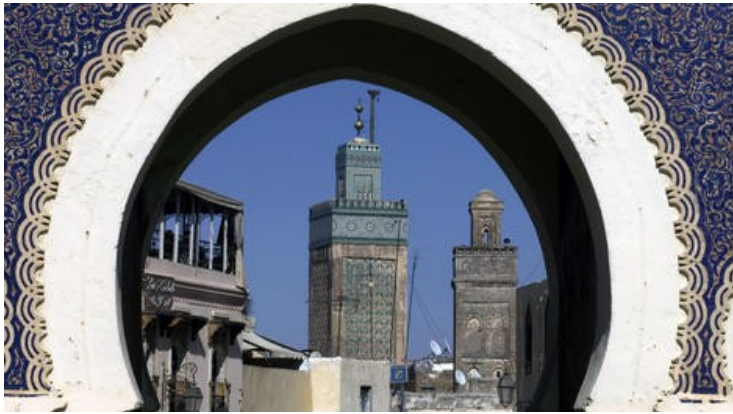
Bab Bou Jeloud (The Blue Gate) and minarets, Fès