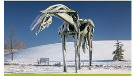
Meijer Garden and Sculpture Park