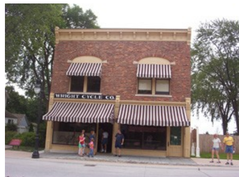
Wright Cycle Shop