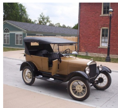
Model T Ford