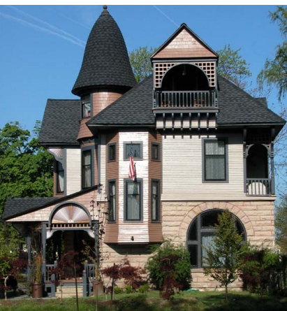
Queen Anne style house

About a typical exchange to our club: There are some activities that we try to do together because they have been popular. These include the Meijer Garden and Sculpture Park and The Ford Museum, explaining about the life and times of President Gerald R. Ford, our government and election process.